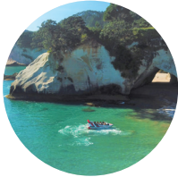
Cathedral Cove Jet cathedralcovejet.co.nz