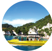
Ocean Leopard Tours oceanleopardtours.co.nz