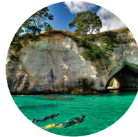
Cathedral Cove Dive and Snorkel hahei.co.nz/diving