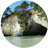
Glass Bottom Boat glassbottomboatwhitianga.co.nz