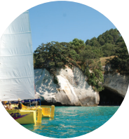
Boom Sailing boomsailing.co.nz