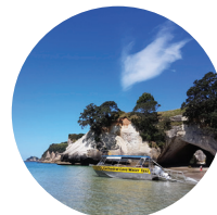
Cathedral Cove Water Taxi cathedralcovewatertaxi.co.nz