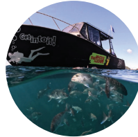
Dive Zone Whitianga divezonewhitianga.co.nz