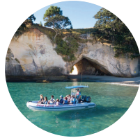
Sea Cave Adventures seacaveadventures.co.nz