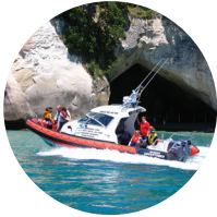
Cathedral Cove Scenic Cruises cathedralcovecruises.co.nz