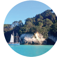
Windborne Charters windborne.co.nz