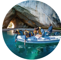
Hahei Explorer haheieplorer.co.nz