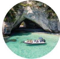
Cave Cruiser cavecruiser.co.nz