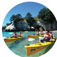
Cathedral Cove Kayaks kayaktours.co.nz