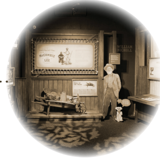
GOLD DISCOVERY CENTRE AND MINE TOURS Seddon Street, Waihi