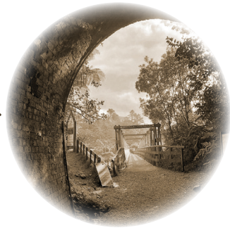
HURAHI RAIL TRAIL