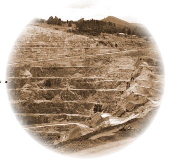
MARTHA MINE PIT RIM WALK Seddon Street, Waihi