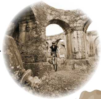
VICTORIA BATTERY SH2 Karangahake