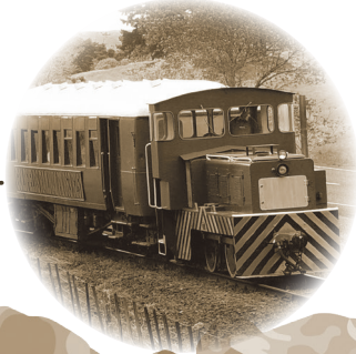
GOLDFIELDS RAILWAY Wrigley Street