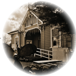
HISTORIC MARITIME PARK SH2 Paeroa