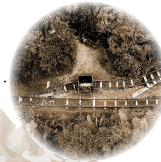
KARANGAHAKE GORGE HISTORIC WALKWAY AND TUNNEL SH2 Karangahake