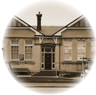
WAIHI ARTS CENTRE AND MUSEUM 54 Kenny Street, Waihi