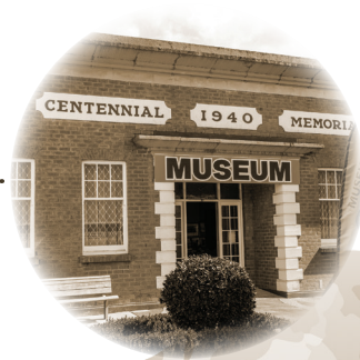
PAEROA AND DISTRICT MUSEUM 37 Belmont Road, Paeroa