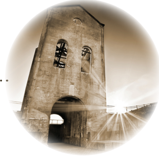
CORNISH PUMPHOUSE Seddon Street, Waihi