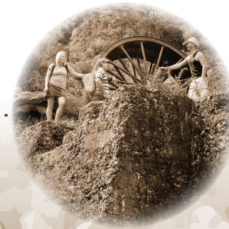
KARANGAHAKE GORGE SH2 Karangahake